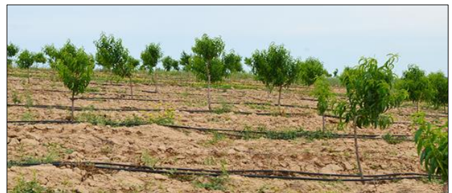
Fig 3: Demonstration of the micro-irrigation regime using drip irrigation of fruit trees in the conditions of the EIA of the Research Institute of Erosion and Irrigation in the Shamakhi district in the village of Malkham.

The discharge was 20-30%, which led to uneven moistening. At the beginning of vegetation due to timely treatments, the surface discharge decreased (up to 8-10%). When the treatment of crops ceased, the discharge again reached 16-17%.