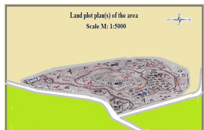
Fig 1: Land plot plan (s) of the area the village Malham of the Shamakhi

With an area of 2.8 hectares and on the EIA of Gyandja RUCN in the village. B / Bagmanli with an area of 4.45 hectares. It has been proven by the results of numerous experiments and researches, when choosing the right crop irrigation technology, it is imperative that we study the agro-soil, natural-economic, geographical relief of the territory and the degree of natural moisture and other characteristics based on the monitoring of multi-year data on the object of research, which we should study. specified in the example of the Shamakhi region, where it was decided to set up experiments in the period 2007-2009. for which it is shown in the table! water-physical and agro-chemical properties of the soil of the object of research, experiments that were carried out on the territory of the village Malham of the Shamakhi region. The results of our analysis showed that on the territory of the Shamakhi region widespread mainly degraded mountain brownish-brown soils are mainly widespread.