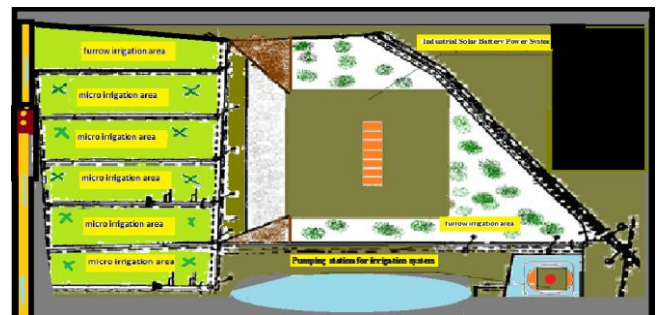
Fig 2: Scheme of the irrigation sprinkling station on the experimental part of the Terter RACS in the Garabagh land in the period 2006-2010 with the use of the Idad and MDR sprinklers:

Where, irrigation was conducted in this period with an irrigation rate of 3800-4200 m 3 / ha. Further all this work was expanded in the Samukhian area of corn on the trees and mulberry trees, in the Shamakhi district in vineyards, in the Guba district of fruit gardens, Khachmas district of vegetable crops (cabbage, eggplant). Studies on sprinkling in this facility have shown that the rainfall in the IDAUD (3 mm / min) is greater than the rate of water absorption into the soil of the research object. Therefore, when feeding 500 m 3 / ha, puddles and surface discharges were formed at the site.