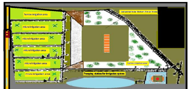
Fig 2: Scheme of the irrigation sprinkling station on the experimental part of the Terter RACS in the Garabagh land in the period 2006-2010 with the use of the Idad and MDR sprinklers:

Reserves of moisture in the soil were insufficient to produce shoots, so in mid-May, the reseeding was carried out after the presowing irrigation with the norm of 250-300 m 3 / ha. Where, irrigation was conducted in this period with an irrigation rate of 3800-4200 m 3 / ha. Further all this work was expanded in the Samukhian area of corn on the trees and mulberry trees, in the Shamakhi district in vineyards, in the Guba district of fruit gardens, Khachmaz district of vegetable crops (cabbage, eggplant). Studies on sprinkling in this facility have shown that the rainfall in the IDAUD (3 mm / min) is greater than the rate of water absorption into the soil of the research object. Therefore, when feeding 500 m 3 / ha, puddles and surface discharges were formed at the site.