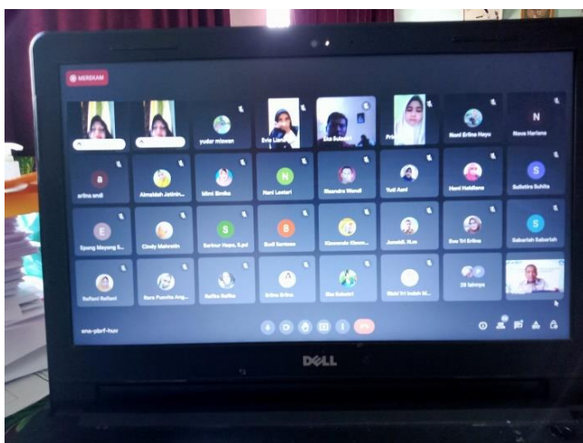
Fig 1: Distance Learning During the COVID-19 Pandemic at SMPN 2 North Rupert

Meanwhile in Indonesia, with a high number of cases, this policy is too dangerous. The government also needs to be careful in giving policies towards a new normal life because making plans to relax social activities will trigger a process of transmission that has great potential and is very likely to occur. Don't let the second big wave of infection become history in this country. Considering that the positive cases of Corona have not decreased significantly due to the inappropriate policies issued. Until now, the condition after COVID-19 is being predicted by experts (Abidah et al. , 2020) [1].