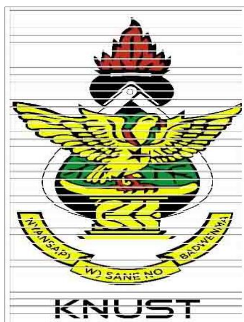
Fig 1: A 2D Rendition of the KNUST Logo

In image printing, a 2D rendition of the KNUST logo illustrated in Figure 1 was designed with indication of parts of the image on strips of 2.5cm length each and 46cm width (46cm width by 104cm length for the whole image). The image was printed out on a sticker paper. Sections of the images in strips were cut out shown in Figure 2. The aluminium blades were removed and the cutout strips were pasted on the blades to form the desired image depicted in Figure 3.