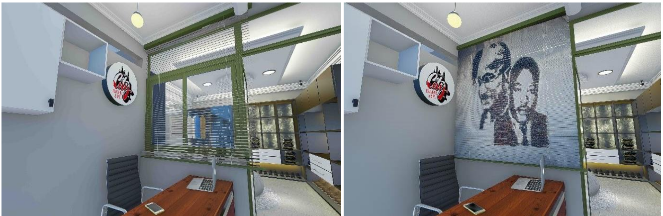
Fig 19: 2D Rendered Image